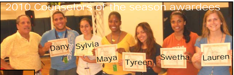
2010 Counselors of the season awardees