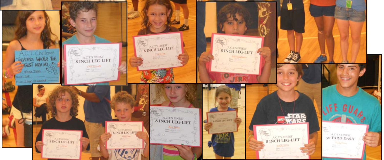
Camper Challenge record holders by division and gender